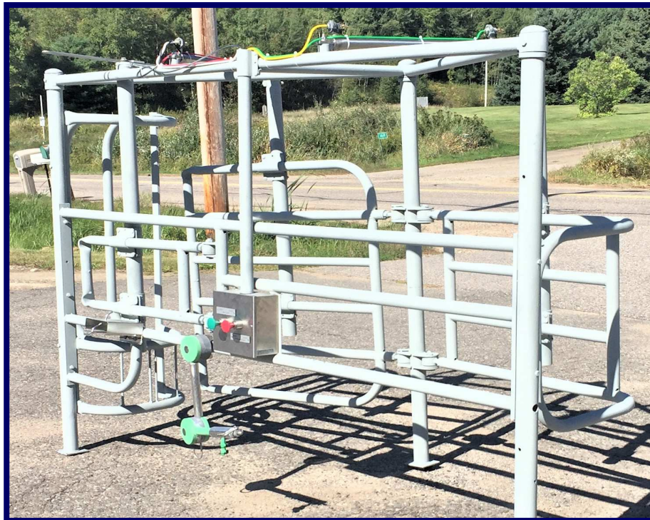
Surge Side Opener/Tandem remanufactured by TechForAg LLC at $1,490 as shown