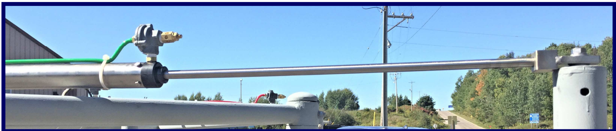
Stainless air pressure cylinders on both gates, speed adjustable.