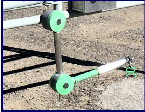
Milk Hose Support Arm included; various models optionally available